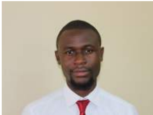
By Isaac Tembo

T he current plans by government to organize cotton markets is likely to win back confidence and trust of smallholder farmers as well as the other cotton stakeholders. Under the proposed arrangement, only buyers (ginners) that had invested and provided for cotton inputs to farmers will be allowed to transact on the cotton output market. This arrangement further necessitates all registered smallholder farmers under the ambit of Cotton Farmers Association (COFA) to sell in groups.