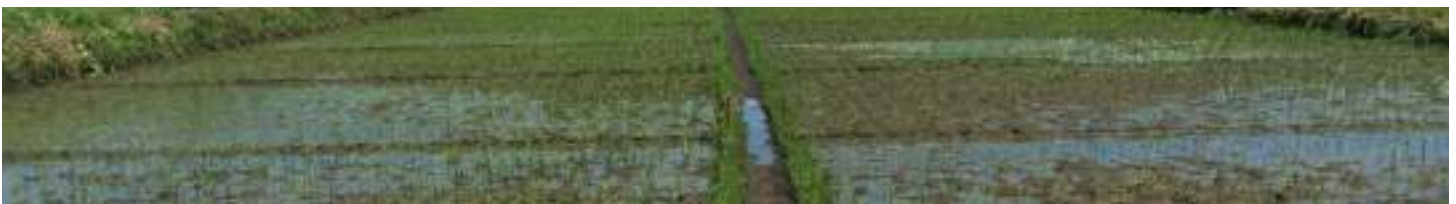
Demonstration plots under SRI technology in Nkhata-bay district

“I thank God that today I have more than enough. I have sent two of my girls to a boarding school and I manage to pay K45, 000 for each one of them per term. My family living conditions have improved and I am financially independent. I have already bought my farm inputs for the coming season through the money I got from VS&L,” She says. “Thanks to AICC, I have become a mirror to the women of my community”.