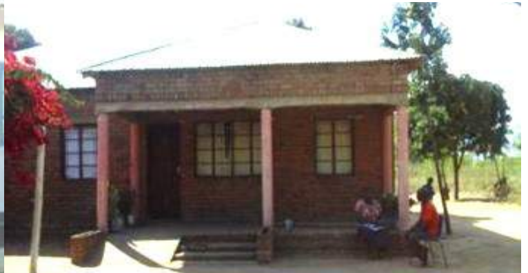
The new house for the Mkumbazala family