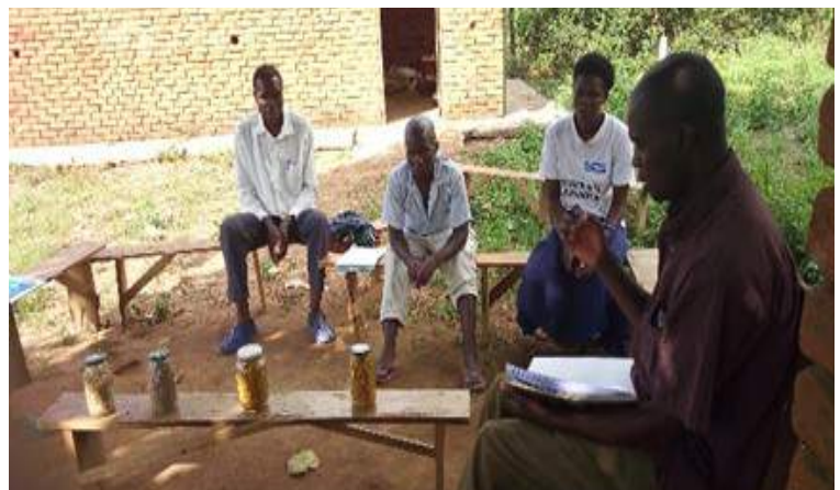
Khajavo cooperative showing tur dhal (Chipere) as part of value addition

Among others, the project promotes innovations in value addition and market linkages in targeted legumes-common bean, groundnut, pigeon pea, sorghum, millet and rice. The emphasis is on promoting market linkages among the value chain players; specifically linking value chain players to commodity exchange, promoting warehouse receipt system and promotion of contract farming.