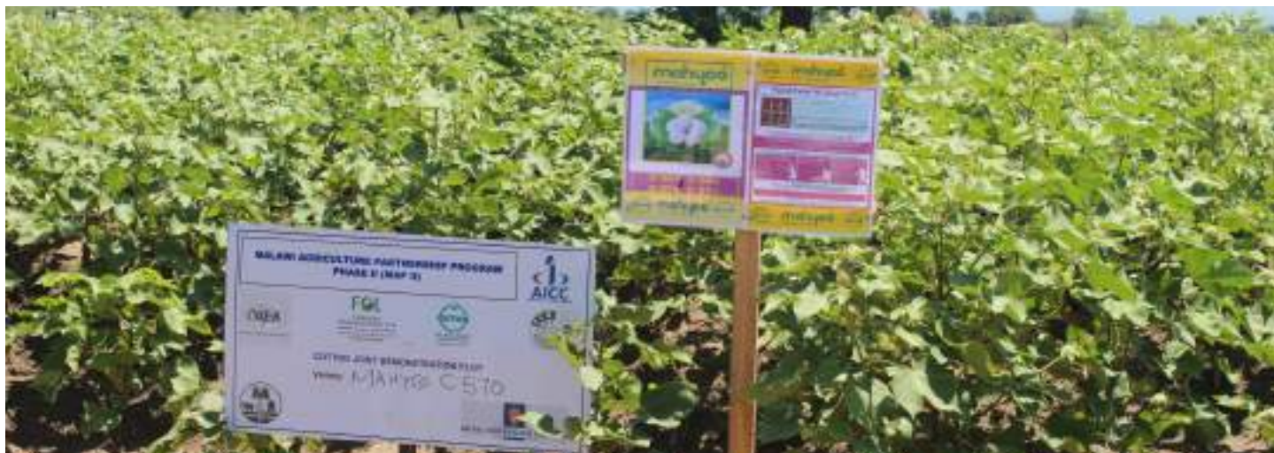
Demonstration plot showing new cotton hybrid seed variety in Rivirivi EPA, Balaka