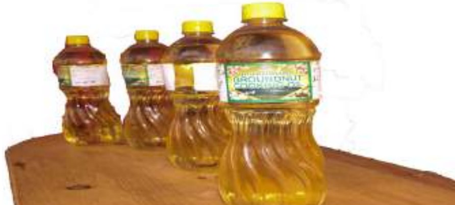
Value added products from Mthiransembe Cooperative, Mchinji