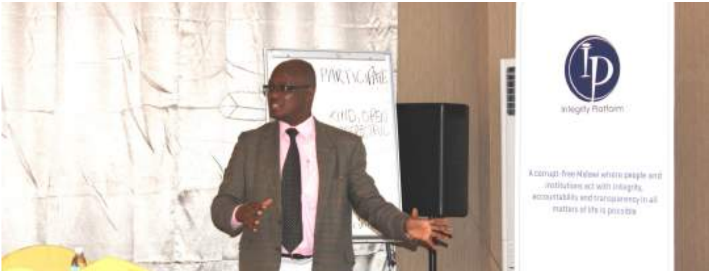
Role of CSO in budget oversight cannot be ignored