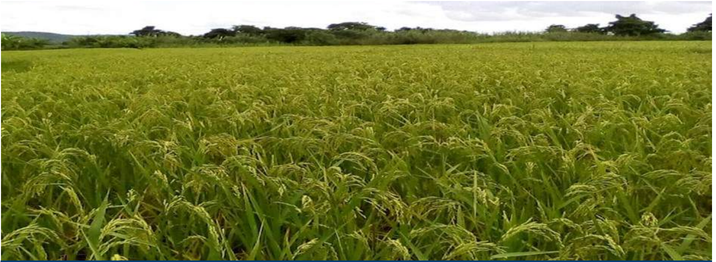
SRI field at Mphinga Irrigation Scheme