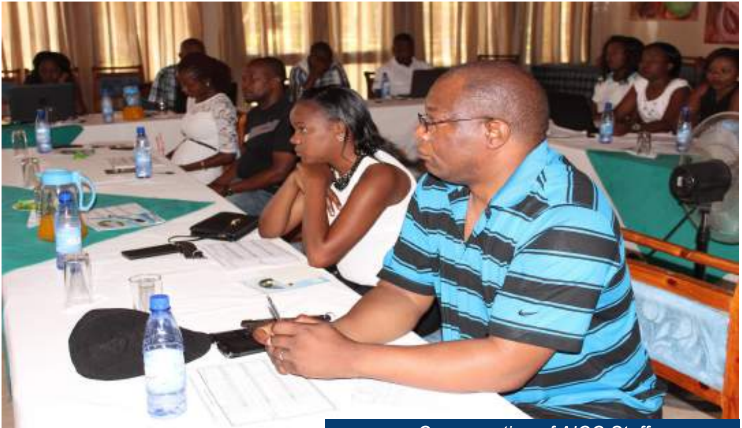
Cross section of AICC Staff