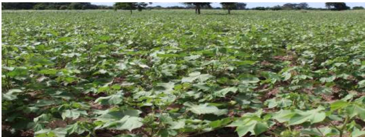
Hybrid cotton field in Chinguluwe EPA, Salima

Like any other technology, farmers have welcomed the new hybrid cotton seed. The only concern is the access to the seed and the underlying costs of accessing the seed. It is yet to be assessed and evaluated on the actual benefits that will accrue from the new cotton variety as the season progresses.