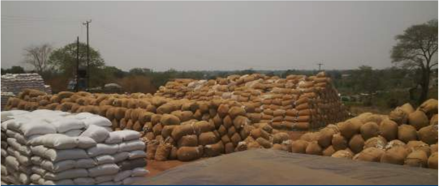
Cotton Aggregation Centre in Blantyre