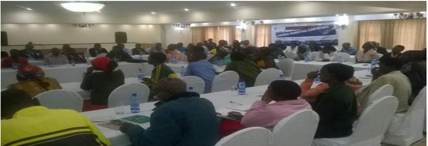
A cross section of stakeholders during a market conference in Lilongwe