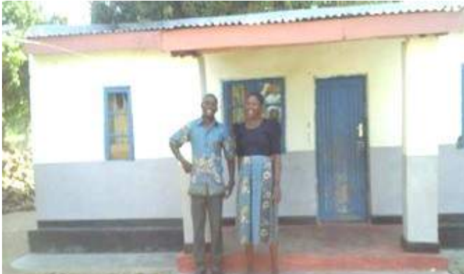
The old house for the Mkumbazala family