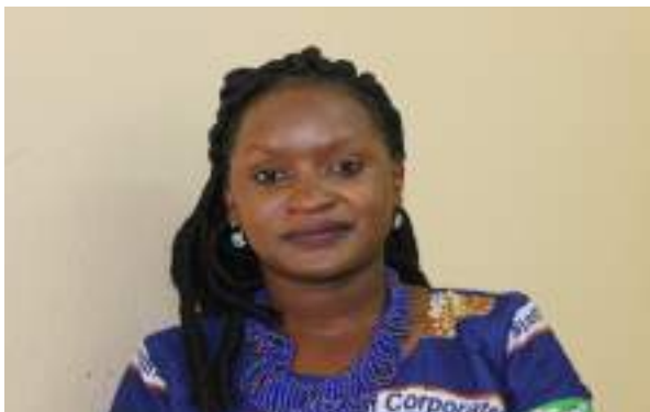
By Winnie Potolani

T he African Institute of Corporate Citizenship (AICC) has developed a new strategic plan which outlines its aspirations to be accomplished between 2017 and 2020. The strategic plan is outlined to form a solid foundation upon which the entire organization's operations, programs and activities will be based within the period. It is also a representation