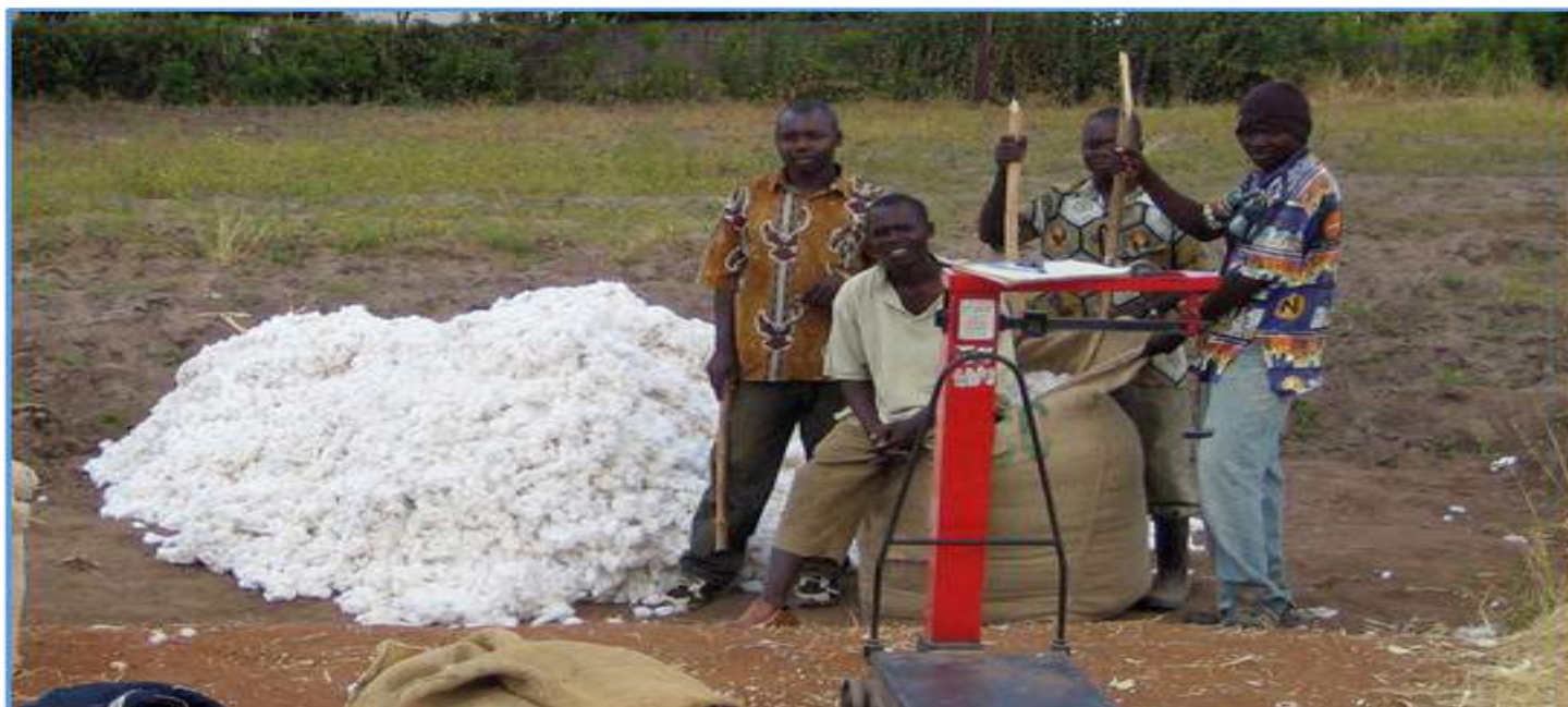
Farmers anticipation for a better marketing season

AICC. The group marketing model in its own stand will also help to add a voice of the farmers on the market. Away from the market, production is the hub of all marketing activities that brings about the future returns. With