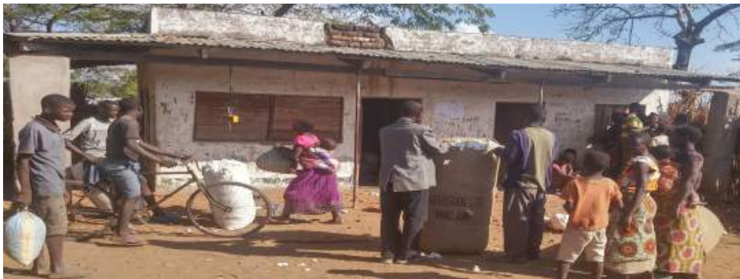
A Cotton Market in Chikwawa