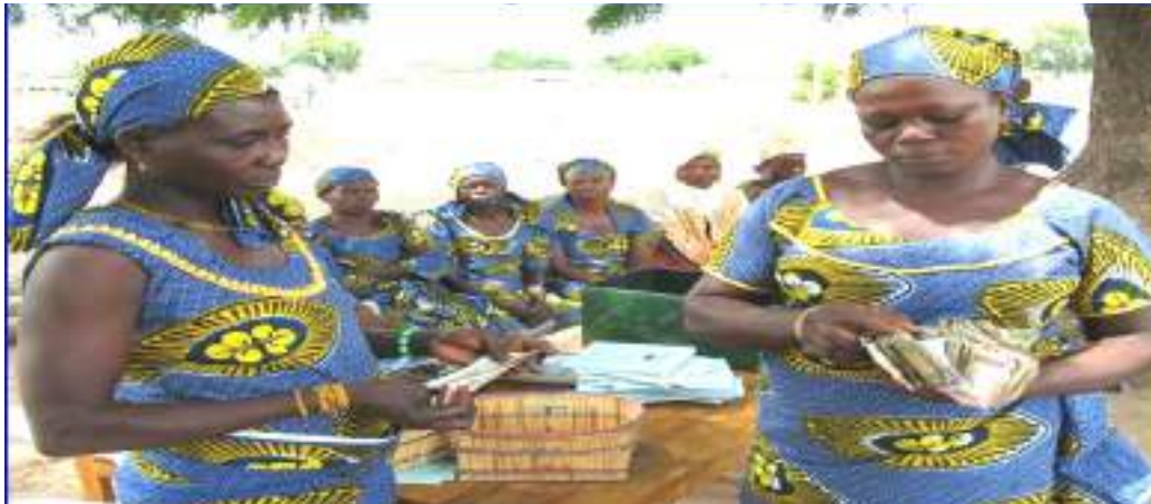
VSL meeting in session