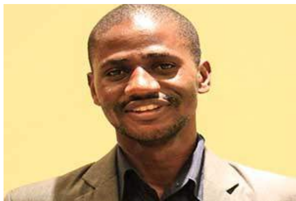
By Chrispin Namwera