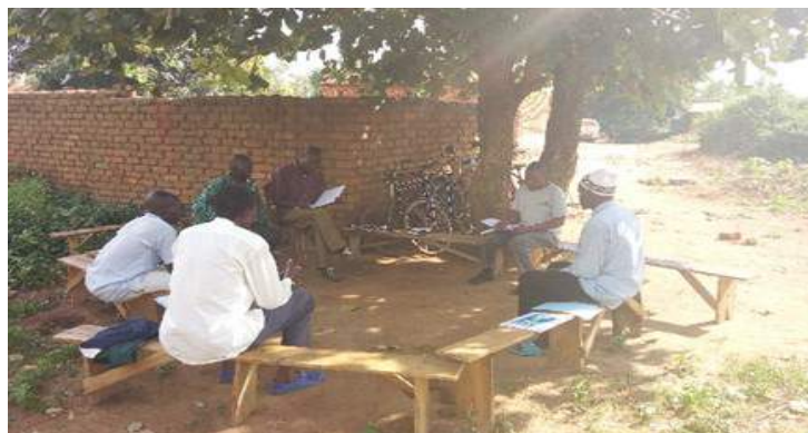
Members of khajavo cooperative in a meeting

The cooperative has since October 2017 started pro-