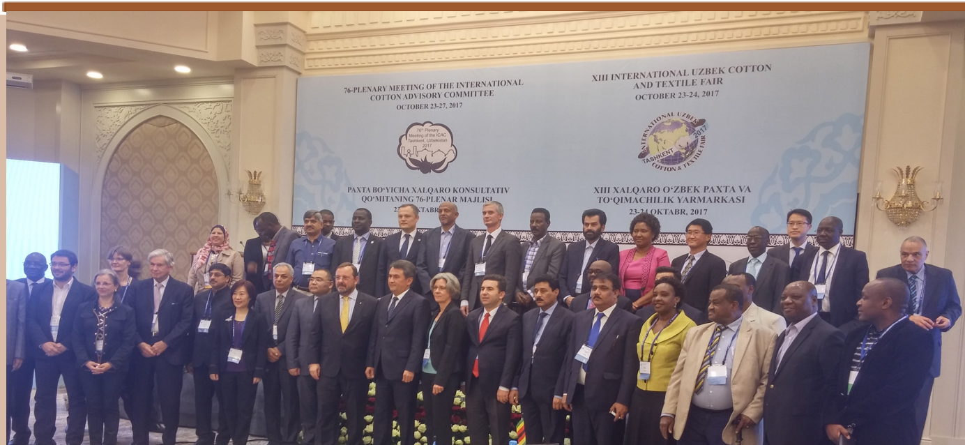
Cross section of participants to the 76 th ICAC plenary session in Uzbekistan

The 76th ICAC Plenary Meeting was held in Tashkent, Uzbekistan from 23rd - 27th October, 2017 under the theme, "Cotton in the Era of Globalisation and Technology Progress". The meeting was attended by 345 persons from over 35 countries, including representatives from 16 Members, four international organizations and nine non-members' countries. Three members from Malawi attended the meeting as observers.