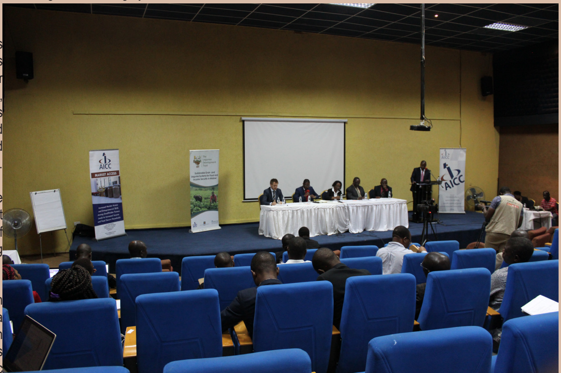
The debate in progress

The panellists have since agreed that there is a need for the