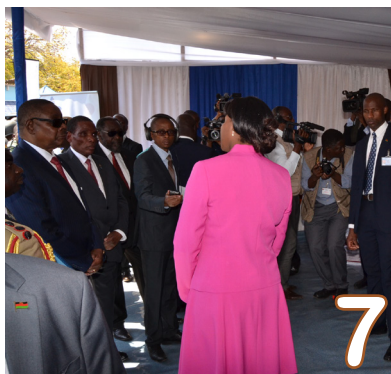
Govt recognizes role of CSOs and PVT sector in agriculture- APM