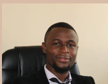
By Isaac Tembo

He additionally applied his indigenous knowledge in controlling pests and weeds. For example, he used flies as indicators of pests which then gave him signals to apply the pesticides. This proved to be very effective and results depicted it all, as by end December, bolls were developed, with pests and diseases fully controlled.