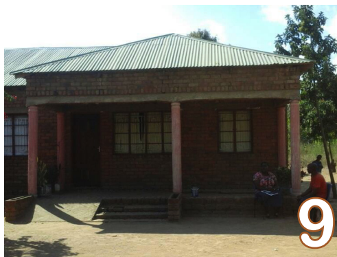
Urbanizing rural housing through VSL initiative