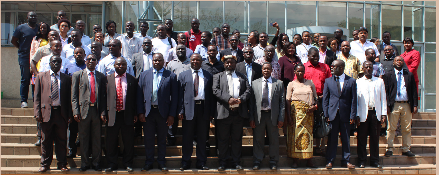
Attendees pose for a group photograph during the conference

In the wake of low grain prices, delegates to a National Conference on the Future of Grain Markets in Malawi yesterday recommended the structuring of the grain market as is the case with tobacco.