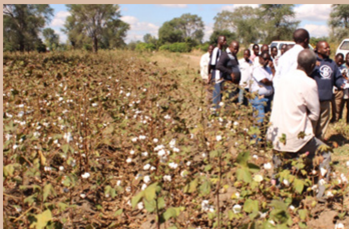
A field visit to GVH Chikadya's cotton field

Cotton production has dwindled over the years hitting as low as 15,000 MT during the 2015/16 season. Small-holder farmers have on average managed to produce 600Kg/Ha, clearly depicting inefficiencies in the production cycles. Contributive to this phenomenon is among other inaccessibility of inputs such as pesticides and certified seed, nevertheless, cotton farmers have been negligent in following good agricultural practices that are paramount as far as cotton production is concerned.