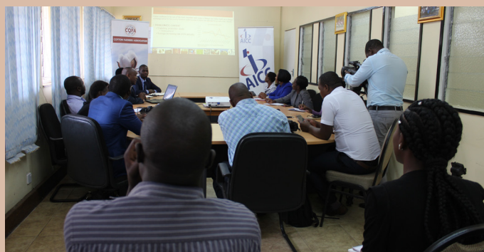
Media Engagement Crucial in Cotton Sector Development

Unfortunately, almost half of seed cotton produced in each country is sold to ginnerers who do not provide inputs. Farmers justify such sales by saying that they need immediate cash and prices offered by reputable ginnerers are "unfair". Ginnerers who participate in pirate buying justify their actions that they need huge volumes to keep their gins running. Zimbabwe and Zambia have embarked on policy solutions which include industry regulation, contract enforcement, and farmer education to build trust and facilitate input delivery to farmers.