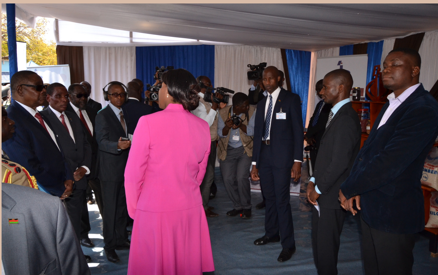
His Excellency Professor Arthur Peter Mutharika touring AICC's pavilion during the 14 th National Agriculture Fair

T he President of the Republic of Malawi, His Excellency Prof. Arthur Peter Muntharika said that his government recognizes the role that the private sector plays in influencing positive change in the country's agriculture sector.