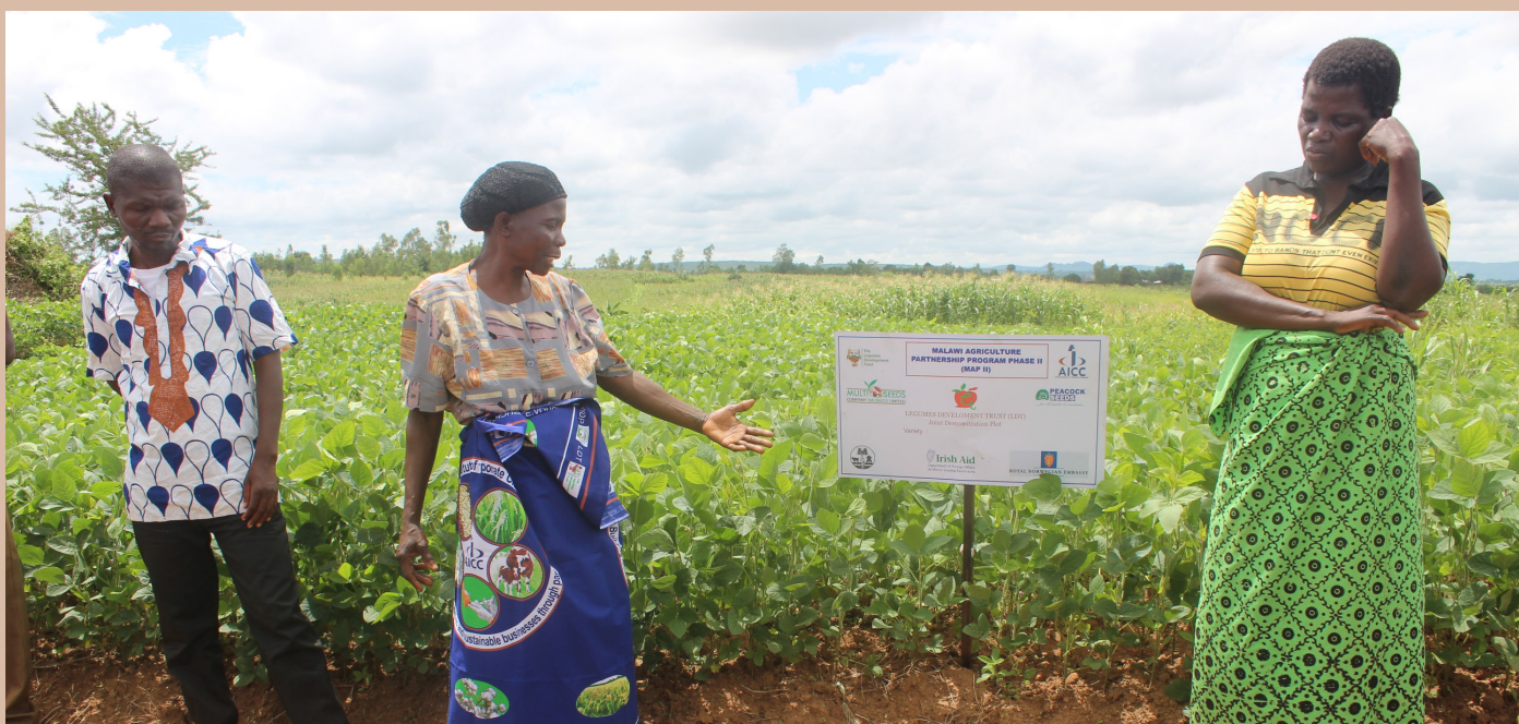
Pigeon pea farmers in Khajavi explaining how they are coping amidst dwindling prices

Pigeon pea is the most versatile grain legume grown by smallholder farmers in Malawi for both consumption and export. The crop accounts for 22 percent of the total Malawi legume production and comes third in terms of hectareage. Malawi ranks first in terms of pigeon pea production in Africa and it is the third largest pigeon pea producer in the world, behind India and Burma.