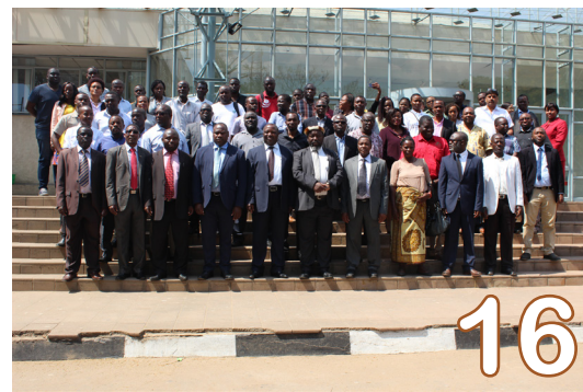
Towards structuring grain markets: new Hope for Malawi