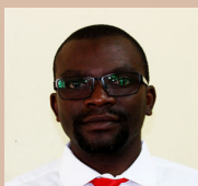
By Kondwani Chitosi

He reassured the nation of his government's commitment to create a conducive environment for investors mentioning the reduction of inflation rate from 24.6 percent in 2014 to 10.2 percent in July 2017.